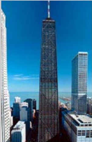
John Hancock Building