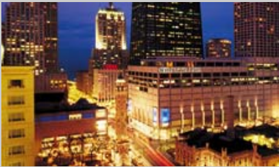
Water Tower Place Shopping Center