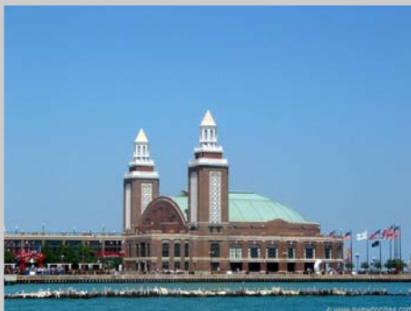
Navy Pier Chicago