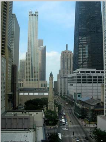
Michigan Avenue Shopping