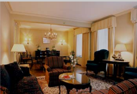
The Delaware Suite Living Room