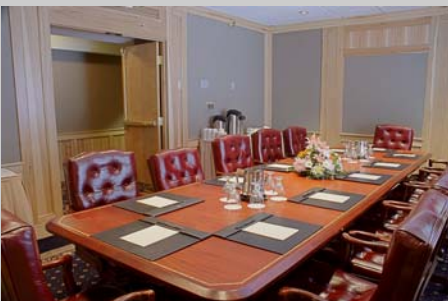
Our Executive Boardroom