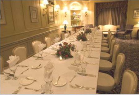
The Tea Room set up for a private function