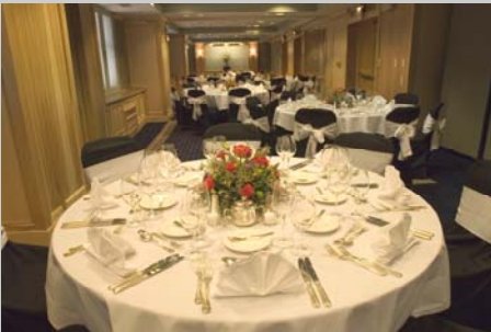
The Salons I, II & III Banquet Style

Personalized Events At A Chicago Landmark