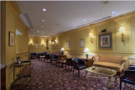
The Tea Room