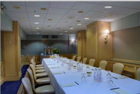
The Colonnade Room