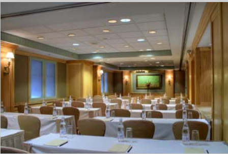
Salons I, II & III Classroom Style