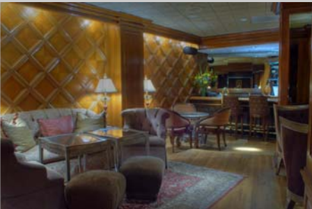
The Whitehall Place Lounge