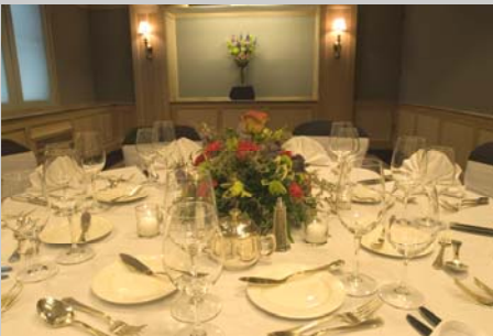
A table setting